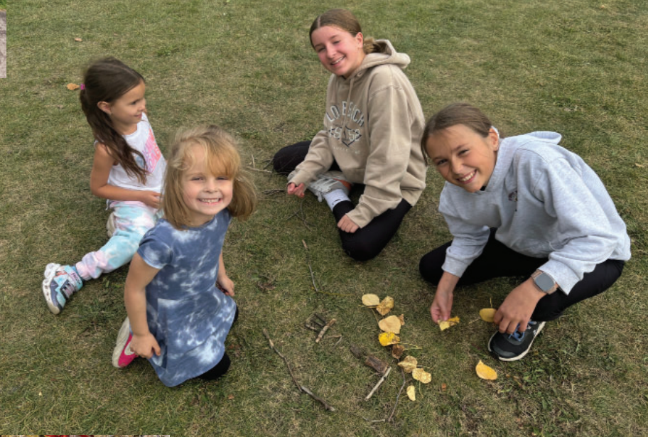
Truth and Reconciliation Day Activities